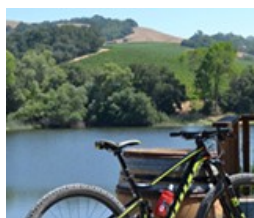
Terroir Track May 15, 2019