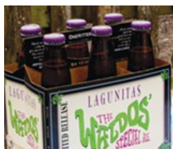
Beer Train May 1, 2019