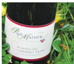
Fling Time Apr 24, 2019